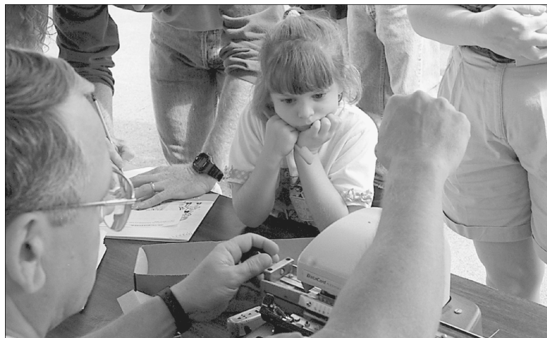
▲ A Personnel Deployment Function customer waits with rapt attention as her dog tags are prepared.