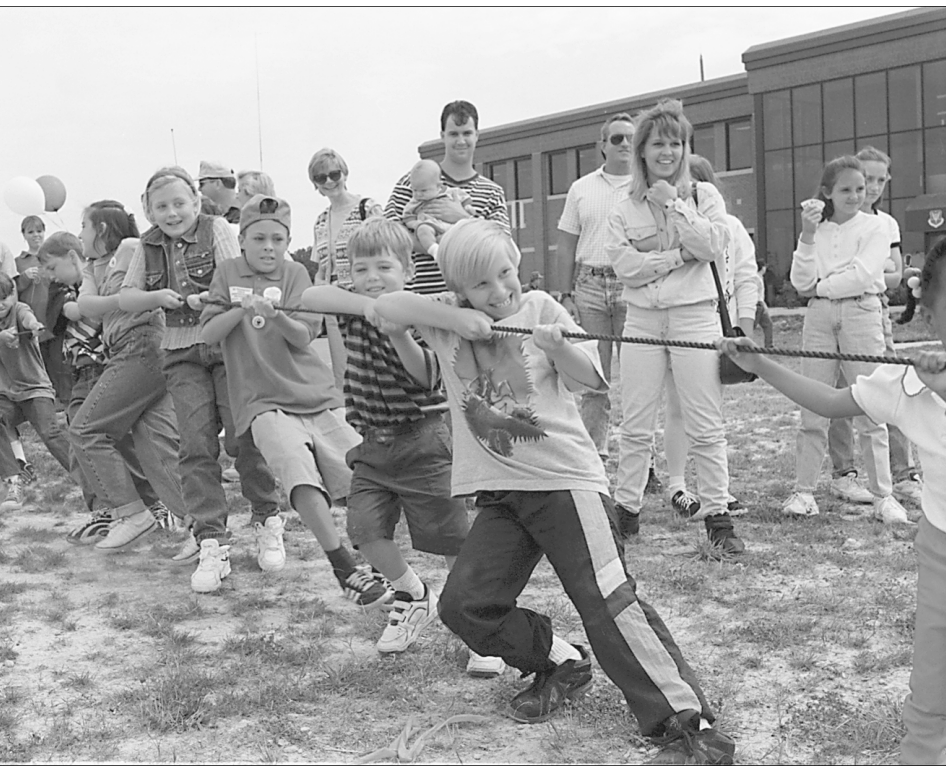
Contests were among the most popular events for Family Day 1996, which drew many visitors to the base.

and demonstrations helped make the liveliest ever. The event, which included combat simulations, drew a record number of visitors to the base.